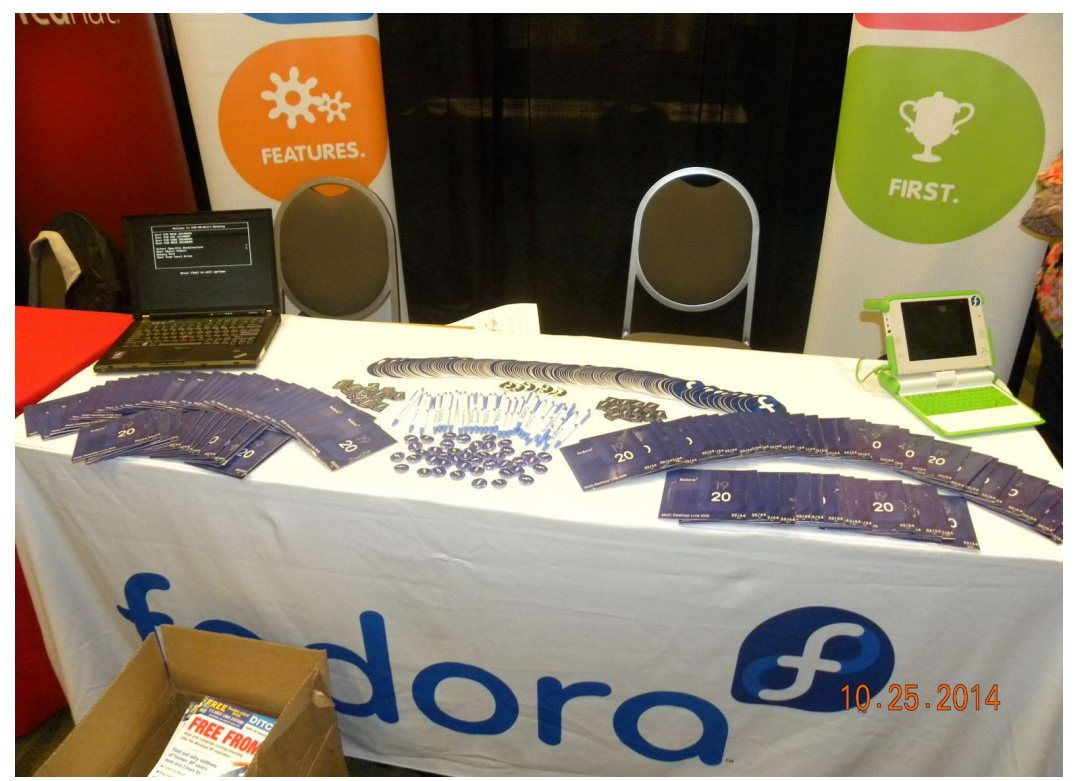
Booth Almost ready

By 930 a. m. the Fedora booth was about 4 deep waiting to get a look at our table. There was many questions posed to us about why should I switch from my current O/S, Ubuntu and Debian seemed to be the hard pressed distributions. Some individuals were very hard to discuss anything concerning Fedora, but if I got through to even one of them, I felt successful. What I found interesting was even though those few individuals who were hard to convince to a change to Fedora, they still picked up the free media anyway. There were other individuals (some of them those hard pressed Debian individuals) were also asking questions about Fedora were unaware of the other media available to them as well.