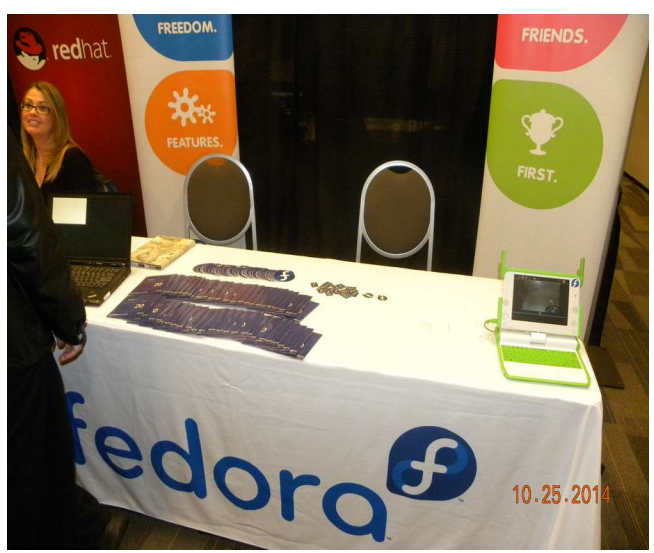
This is all we had left at 430 P. M.

more than happy to aide him in is request. He also asked if there were to be an event scheduled in his area would we as Fedora be willing to attend (invited). I let him know that we could surely ask when the time came to make the invite for Fedora through the website or get a hold of an Ambassador to get the request on the schedule. This may turn into a good opportunity to distribute more and help others learn about Linux.